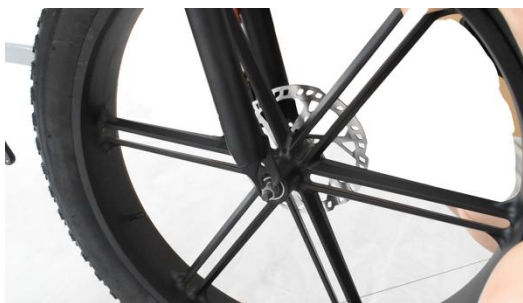
01 Put the wheel on the end of the front fork (you may need help from another person)