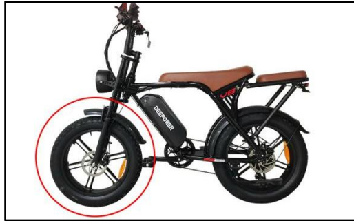
01 Assembled wheel