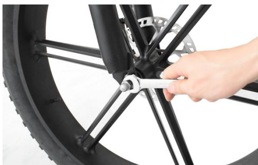
05 Tighten the nut with a wrench