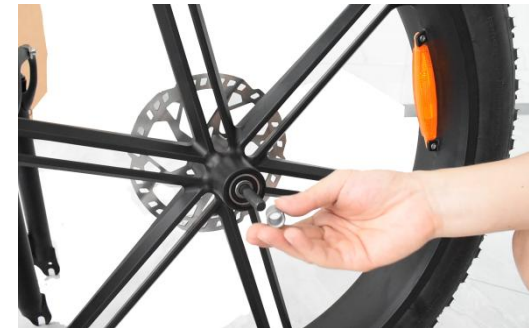
06 Install relatively large ring shaped parts