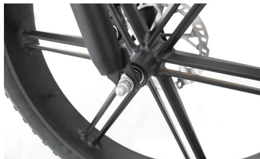
04 Mounting nut