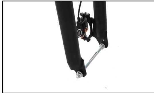
02 There is an iron bar at the bottom of the wheel