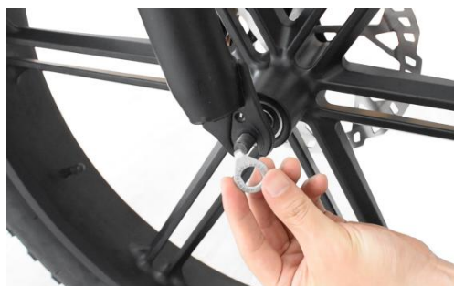
02 Install the part in the shape of the water drop, the upper part of the bend into the hole (very important)