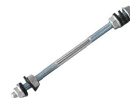
06 The white iron bar you just took down can be discarded