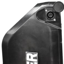
04 On the other side of the battery key is the charging port, you can put the battery on the bike to charge it, or you can take it off