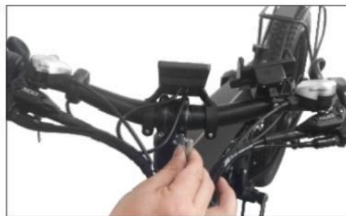
05 Mount handlebar onto stem, then replace stem cover and tighten all 4 bolts