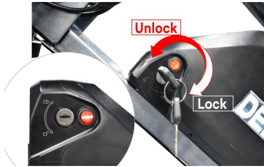
02 The battery is marked with the direction of locking and unlocking