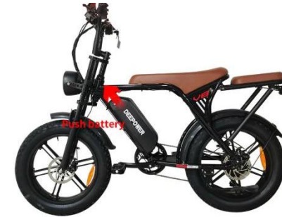
03 After unlocking the battery, push the battery upward to remove it (you need a lot of force because the battery is heavy)