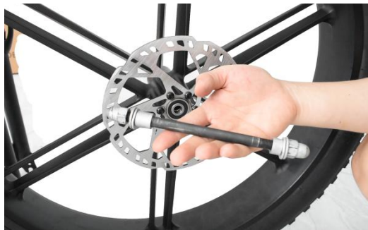
04 Find the connecting rod of the wheel (it is black)