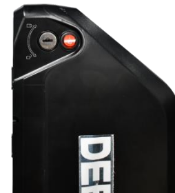
The red button is meaningless and nothing will happen if you use it