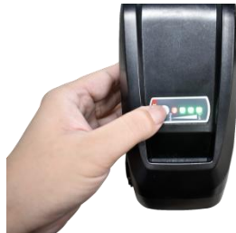
Press and hold the button on the battery to see how much power is left