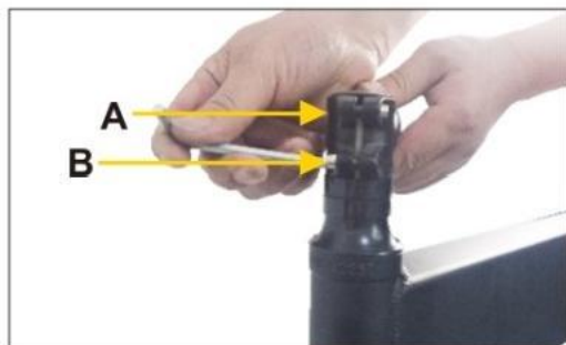
01 Loosen the riser sides A,B screws *Before installation, pay attention to the front and rear brakes always on the same side