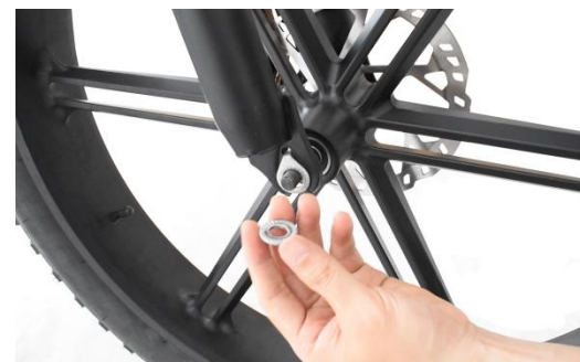
03 Install small rings