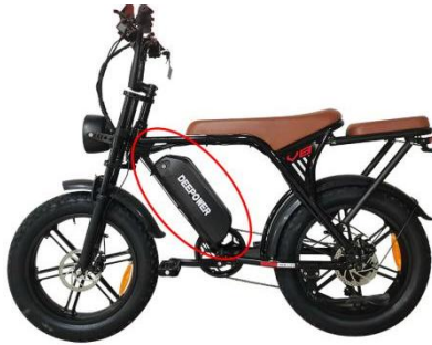
01 Remove battery