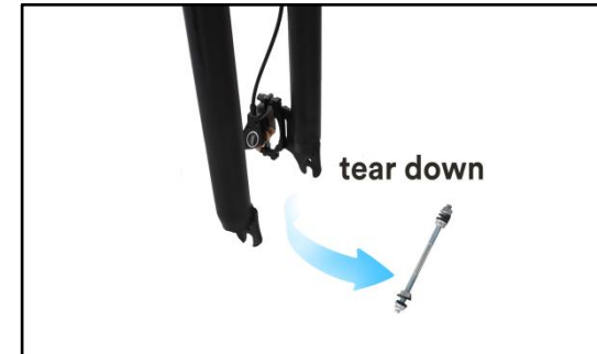
03 Remove the iron bar with a screwdriver