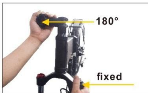
02 Fix the front shock absorber and rotate the riser 180°