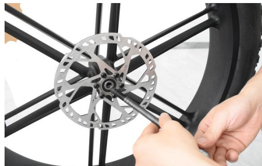
05 Remove one end with a wrench and insert it into the middle of the wheel