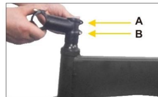
03 Tighten the side A,B screws