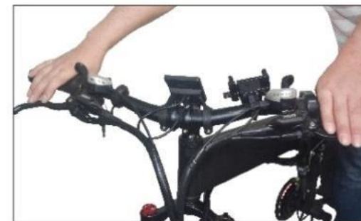
06 Adjust handlebar according to your needs, then ensure all bolts are tightened firmly